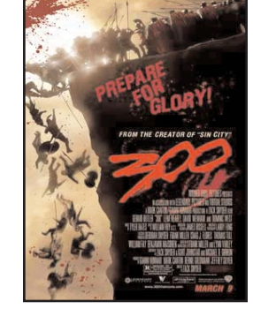
At Home for a Movie