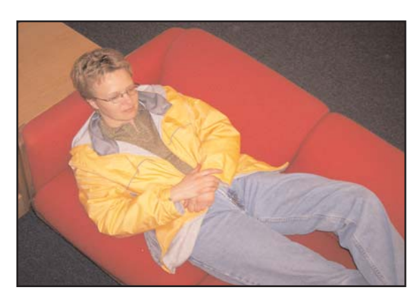
Found the couch, which is (I insist) better than a bucket.