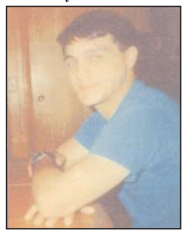
February 28, 1969 to May 1, 2005

One day an angel came to earth to seek a child to dwell above. He chose a wonderful person whom everyone had learned to love.