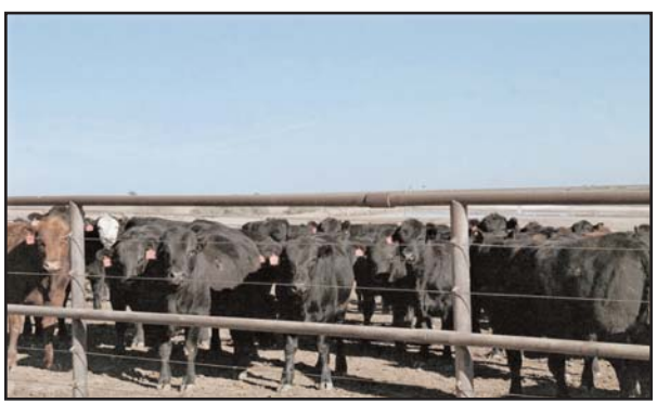
Dusty Schmid Red-tagged - soon to be body-bagged

Note: I don't know why the bins are cooled – do chemicals rot like the ground beneath our manufactured cows?