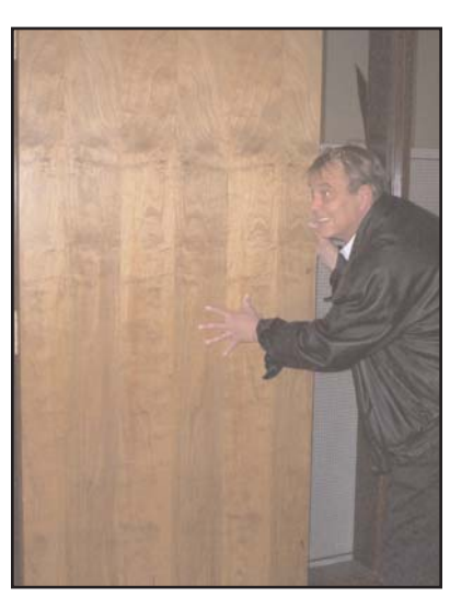
Found the door, but it's not carved. Yet. (We're lobbying for time and money.)