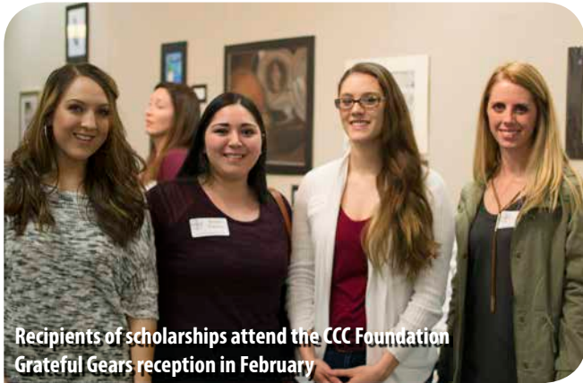
Recipients of scholarships attend the CCC Foundation Grateful Gears reception in February